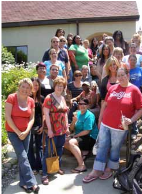
YWCA staff at Inspire Retreat at Pokagon State Park

2010 also brought the implementation of a new strategic plan to guide our work through 2012. Thanks to Foellinger Foundation we received a five-year in-depth review of our financial picture and scenario planning related to our physical footprint. New computers and phone system that tied our two locations together were possible through the generosity of Community Foundation of Greater Fort Wayne.