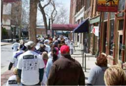
Homeward Bound Walkers raise awareness funds.