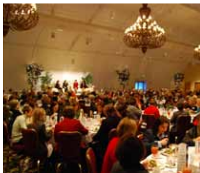
2010 Circle of Women Luncheon at the Marriott

We celebrated our 5th Annual Flowers on the River Walk to honor those lives affected by Domestic Violence. To bring awareness about violence to young children Peace Story Time was held at the Allen County Public Library. We partnered with local colleges and high schools again this year for Chalk It up to Awareness , students used sidewalk chalk to write domestic violence facts, statistics, quotes, or drawings to create awareness about domestic violence.