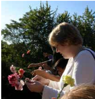
Flowers on the River 2010