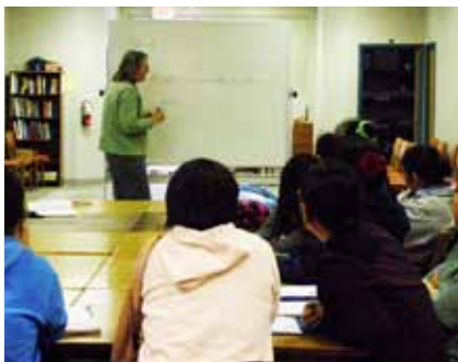
ESL classes for Burmese refugees

Diversity Dialogue continued to be a monthly forum for community members to be educated and discuss difficult topics that often lead to anger and division in our community. Average attendance was 22 individuals and this year 55 new participants took part in one or more dialogues.