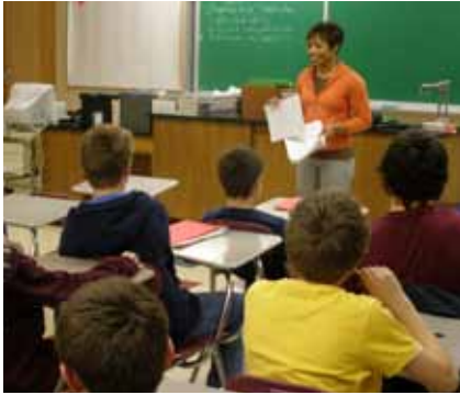
Education Advocate presents to students