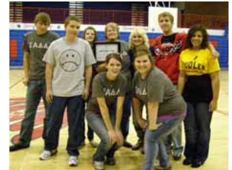
Junior Hope Award winners Whitko High School

This year the YWCA Northeast Indiana, in collaboration with the Women's Bureau, League of Women Voters and the AAUW, presented a special viewing of Iron Jawed Angels. The film tells the remarkable story of a group of passionate and dynamic young women, who put their lives on the line to fight for American women's right to vote.